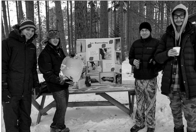
VCC students and their ice harvesting interpretive station at Whirlwind!