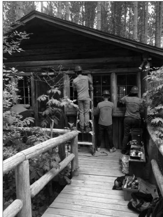
Crew members from the Northern Bedrock Historic Preservation Corps work on reglazing the windows of the Point Cabin.

T his August, the Museum hosted the Northern Bedrock Historic Preservation Corps (NBHPC) to work on its ongoing cabin window reglazing project to preserve the original windows of the Point and Winter Cabins, which were built in the late-1920s.