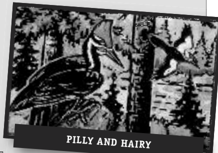
PILLY AND HAIRY

If you've been driving down Sheridan Street in Ely since August, you may have noticed we have a new billboard! Thanks to the volunteer design work of T DESIGN , the generous sign space donated by Motel Ely and the in-kind service donation of a cherry-picker by Fenske Tree Service to hang the signage, the Museum was able to install a two-sided, 15' x 6' sign across from the Holiday Gas Station . Both