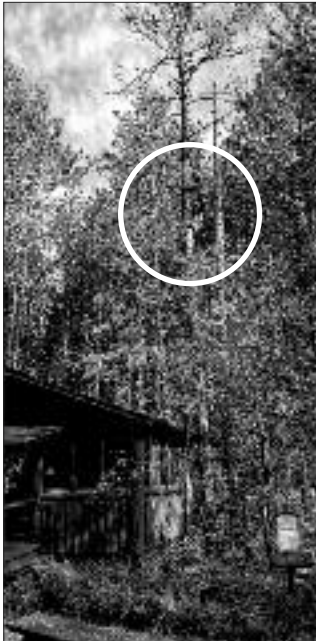
Beartooth Tree Service up in a dead red pine next to the Winter Cabin (left) Freshly painted logs/window trim, washed windows and new red doors (right)