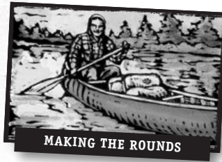
MAKING THE ROUNDS

PO Box 391 Hwy 169 (Sheridan St.) on the east side of Ely 2002 E Sheridan St. Ely, MN 55731